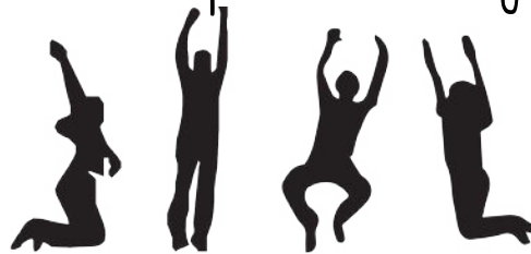
CHART Creating Healthy and Responsible Teens