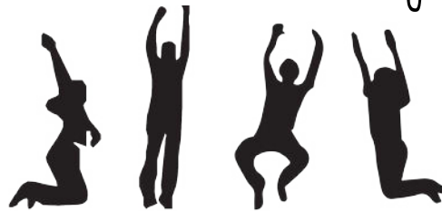
CHART Creating Healthy and Responsible Teens