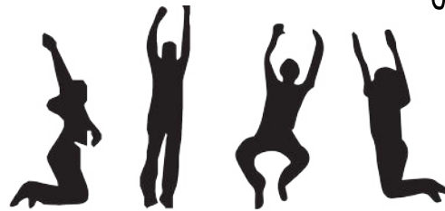
CHART Creating Healthy and Responsible Teens