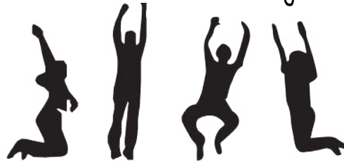
CHART Creating Healthy and Responsible Teens