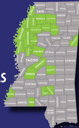
CHART , an "abstinence-plus" initiative, HAS BEEN ADOPTED IN 22 COUNTIES statewide.