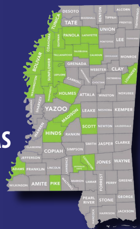
CHART , an "abstinence-plus" initiative, HAS BEEN ADOPTED IN 22 COUNTIES statewide.