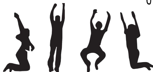
CHART Creating Healthy and Responsible Teens