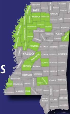
CHART , an "abstinence-plus" initiative, HAS BEEN ADOPTED IN 22 COUNTIES statewide.