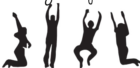
CHART Creating Healthy and Responsible Teens