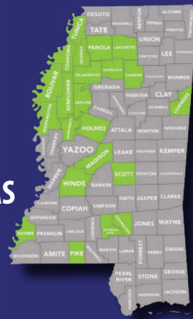
CHART , an "abstinence-plus" initiative, HAS BEEN ADOPTED IN 22 COUNTIES statewide.