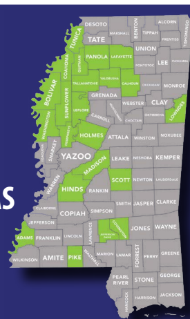
CHART , an "abstinence-plus" initiative, HAS BEEN ADOPTED IN 22 COUNTIES statewide.