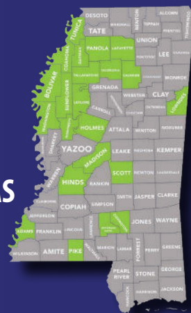
CHART , an "abstinence-plus" initiative, HAS BEEN ADOPTED IN 22 COUNTIES statewide.