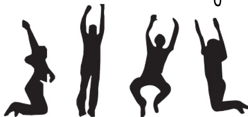
CHART Creating Healthy and Responsible Teens