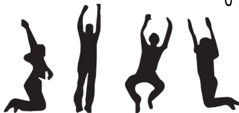
CHART Creating Healthy and Responsible Teens