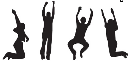
CHART Creating Healthy and Responsible Teens