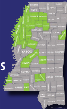
CHART , an "abstinence-plus" initiative, HAS BEEN ADOPTED IN 22 COUNTIES statewide.