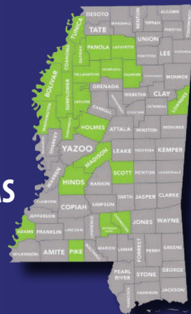
CHART , an "abstinence-plus" initiative, HAS BEEN ADOPTED IN 22 COUNTIES statewide.