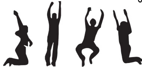
CHART Creating Healthy and Responsible Teens