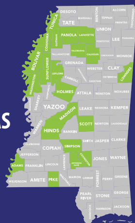
CHART , an "abstinence-plus" initiative, HAS BEEN ADOPTED IN 21 COUNTIES statewide.