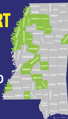
CHART an "abstinence-plus" initiative, HAS BEEN ADOPTED IN 21 COUNTIES statewide.