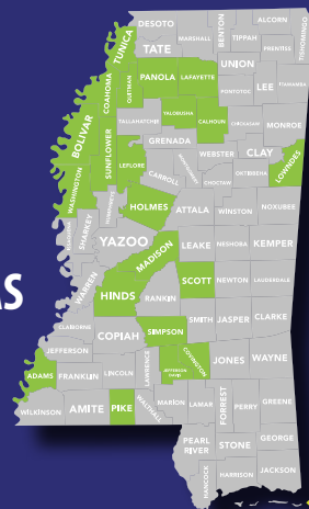
CHART , an "abstinence-plus" initiative, HAS BEEN ADOPTED IN 21 COUNTIES statewide.