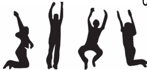
CHART Creating Healthy and Responsible Teens