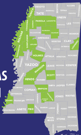
CHART , an "abstinence-plus" initiative, HAS BEEN ADOPTED IN 21 COUNTIES statewide.