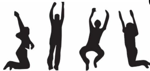
CHART Creating Healthy and Responsible Teens