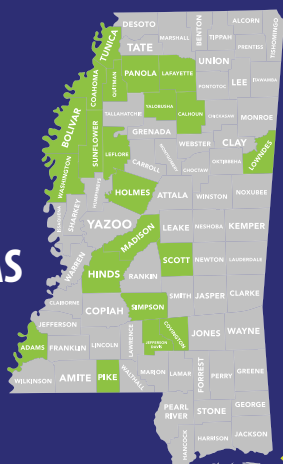
CHART an "abstinence-plus" initiative, HAS BEEN ADOPTED IN 21 COUNTIES statewide.