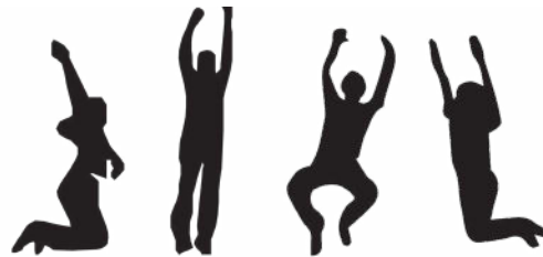
CHART Creating Healthy and Responsible Teens