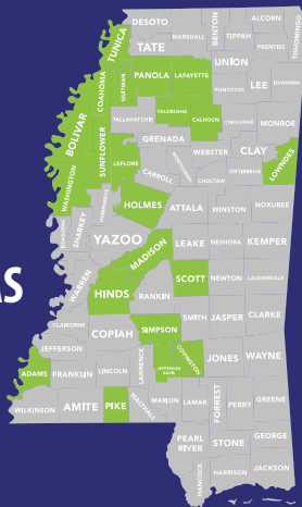
CHART an "abstinence-plus" initiative, HAS BEEN ADOPTED IN 21 COUNTIES statewide.