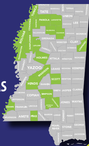
CHART , an "abstinence-plus" initiative, HAS BEEN ADOPTED IN 21 COUNTIES statewide.