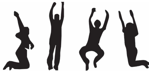
CHART Creating Healthy and Responsible Teens