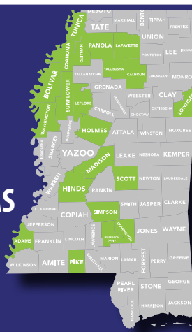
CHART , an "abstinence-plus" initiative, HAS BEEN ADOPTED IN 21 COUNTIES statewide.