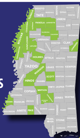
CHART , an "abstinence-plus" initiative, HAS BEEN ADOPTED IN 21 COUNTIES statewide.