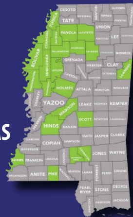
CHART , an "abstinence-plus" initiative, HAS BEEN ADOPTED IN 21 COUNTIES statewide.