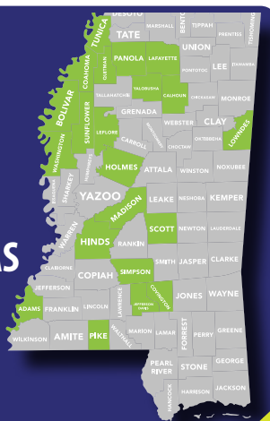
CHART , an "abstinence-plus" initiative, HAS BEEN ADOPTED IN 21 COUNTIES statewide.