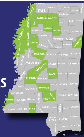
CHART , an "abstinence-plus" initiative, HAS BEEN ADOPTED IN 21 COUNTIES statewide.