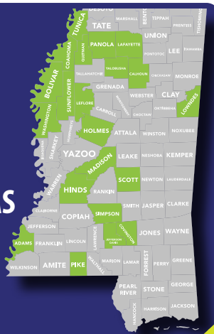
CHART , an "abstinence-plus" initiative, HAS BEEN ADOPTED IN 21 COUNTIES statewide.